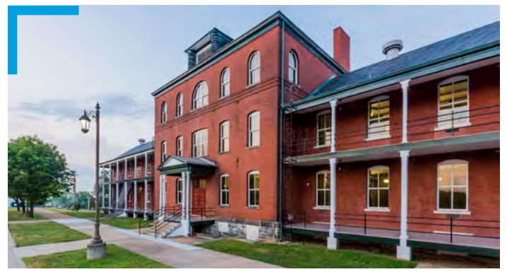
Repair/Renovate Building 29 Jefferson Barracks ANGS, Missouri

Repurposed open-bay barracks into an open-office administration facility with adaptable and configurable work spaces