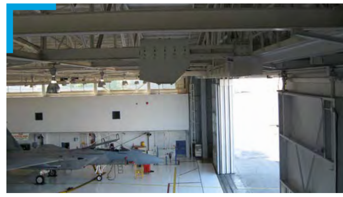
Repair Maintenance Shops Hangar Portland ANGB, Oregon

Full-depth reconstruction of the main taxiway route to access Runway 19, which remained open through construction