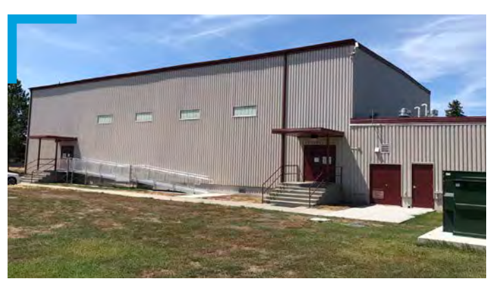
Repair Multi-Use Facility B127 Kingsley Field ANGB, Oregon

Consolidated two entry gates into a single, AT/FP-compliant entry control facility inside base's long-term lease area