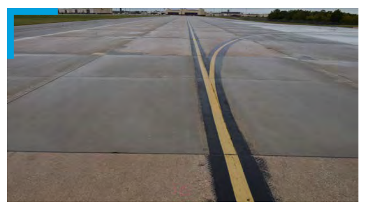
Repair Taxiway Alpha Whiteman AFB, Missouri

Repurposed open-bay barracks into an open-office administration facility with adaptable and configurable work spaces